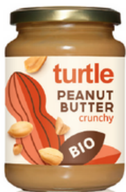
100% PB CRUNCHY 350G

Say hello to truly healthy and amazingly delicious spreads! Made from few really good ingredients, these products are vastly superior alternatives to the existing chocolate spreads. The taste is amazing and the product is healthy: organic, vegan, rich in fibre, low in sugar and zero palm oil!