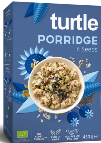
PORRIDGE 6 SEEDS 450G