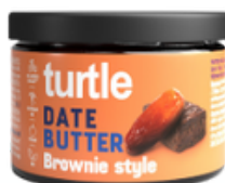
DATE BUTTER BROWNIE STYLE 200G