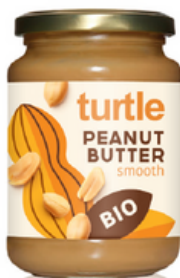
100% PB SMOOTH 350G