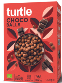
CHOCO BALLS 300G