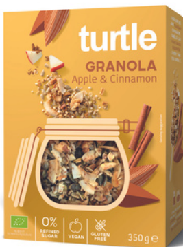
GRANOLA APPEL & CINNAMON 350G