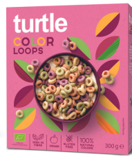
COLOR LOOPS 300G