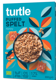
PUFFED SPELT & HONEY 300G