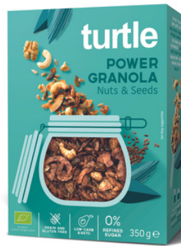
POWER GRANOLA NUTS & SEEDS 350G