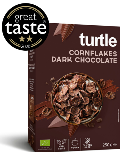
CORNFLAKES DARK CHOCOLATE 250G

You have not known tasty chocolate cereals until you try our chocolate coated cornflakes. The dark version received 2 stars at the great taste award, as the only chocolate cereal EVER. We believe this makes our cereals the world's best chocolate cereals. As a small bonus, they also contain way less sugar than normal chocolate cereals, they are organic, gluten free and the dark one is vegan.