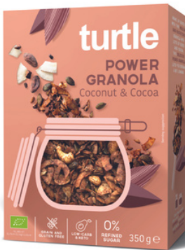
POWER GRANOLA COCONUT & COCOA 350G

Power granola? The absence of cereals keeps the carbs to a minimum, making these granolas suitable for keto-, paleo- and low carb diets. The nuts and seeds have a high protein content and good fats. And also, it just tastes super good.