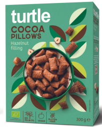
COCOA PILLOWS & HAZELNUT FILLING 300G