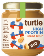
HIGH PROTEIN PEANUT BUTTER 200G