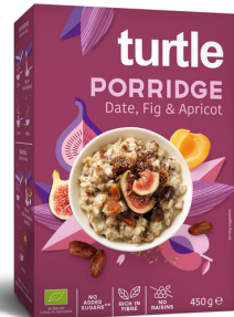
PORRIDGE DATE, FIG & APRICOT 450G