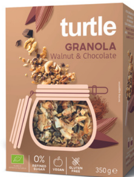
GRANOLA WALNUTS & CHOCOLATE 350G