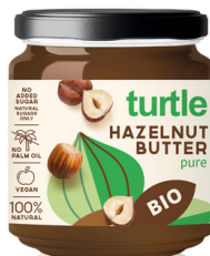
100% PURE HAZELNUT BUTTER 200G