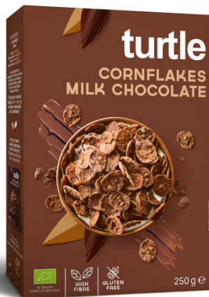
CORNFLAKES MILK CHOCOLATE 250G