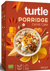
PORRIDGE CARROT CAKE 400G

Why? Because porridge is delicious and it's the healthiest breakfast you can get! Wholemeal rolled oats with dried fruits and seeds, it's a satiating satisfying super breakfast.