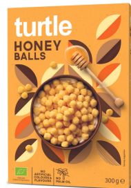
HONEY BALLS 300G