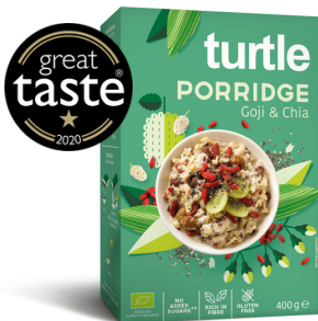
PORRIDGE GOJI & CHIA GF 400G