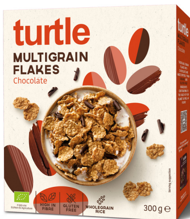
MULTIGRAIN FLAKES & CHOCOLATE 300G

Having a great day starts with a great breakfast! This delicious range of fibre-rich cereals will boost your fibre intake and preserve a well-functioning digestive system. With Turtle Bran Flakes and the gluten free Multigrain Flakes with Chocolate, everyone can get their fibres, while enjoying a delicious bowl of cereals!