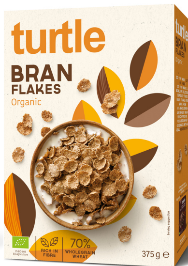
BRAN FLAKES 375G