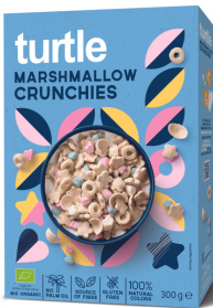
MARSHMALLOW CRUNCHIES 300G

The classics we all know, but better. We want to offer the classic taste and textures of our favourite cereals, made from organic ingredients, with less sugar and more fibre and even with some vegan, gluten free and low sugar options.