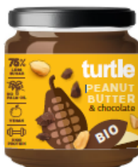
PEANUT BUTTER & CHOCOLATE 200G