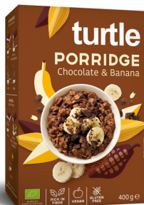
PORRIDGE CHOCOLATE & BANANA GF 400G