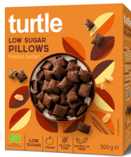
PEANUT BUTTER PILLOWS LOW SUGAR 300G