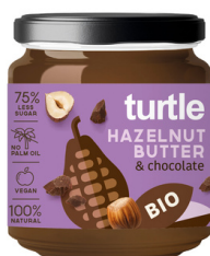
HAZELNUT BUTTER & CHOCOLATE 200G