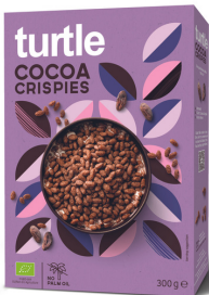
COCOA CRISPIES 300G